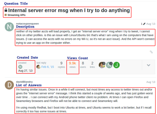
Figure 2: An annotated screen shot of discussions from Twitter Community, a developer forum for Twitter developers.

In this section, we briefly describe the Question & Answer websites, as well as our approach (as shown in Figure 1) for analyzing discussions among client developers.